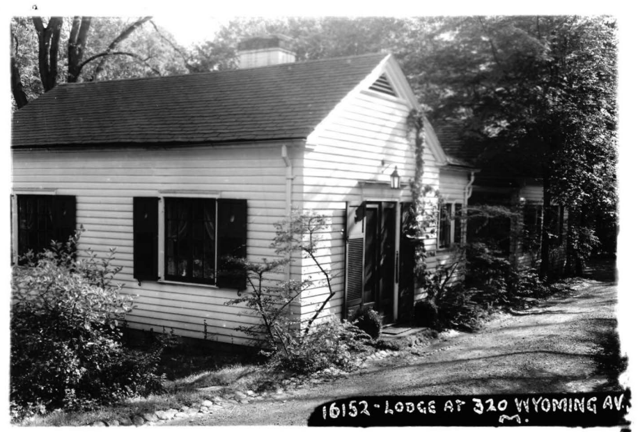
doard of Realtors of the Oranges and Maplewood